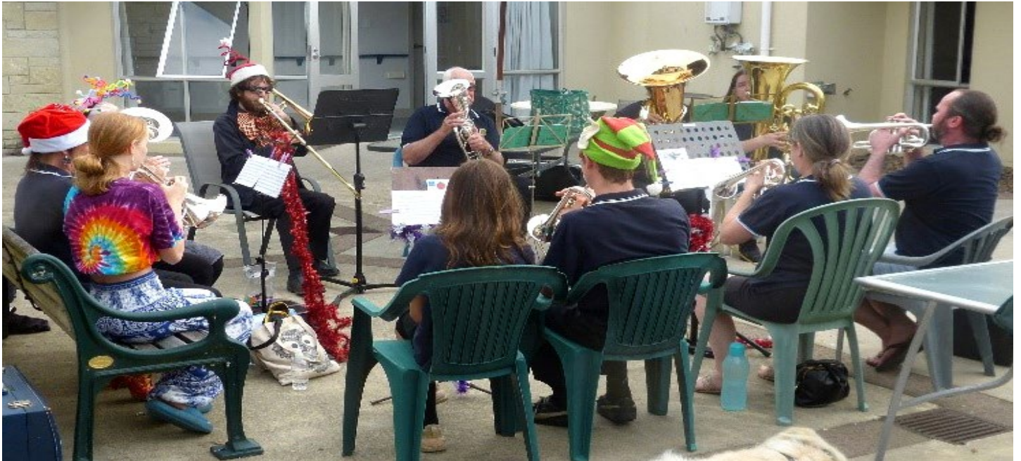
Carolling at Resthaven Hospital in Cambridge.