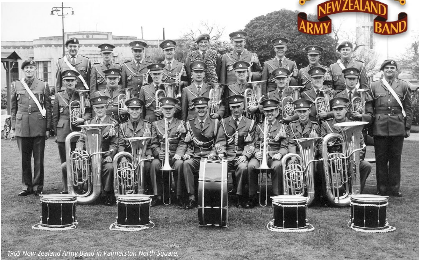
1965 New Zealand Army Band in Palmerston North Square.